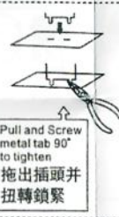
Schematic drawing of sheet metals (two pieces of sheet metals). 金屬片示意圖 (有2片金屬)